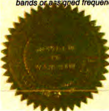
DOROTHY A. RESCIGNO Deputy Commissioner of Maritime Affairs The Republic of Vanuatu

Issued by authority of the Government of the Republic of Vanuatu under my hand and seal at the port of New York this 8TH day of FEBRUARY 2018.